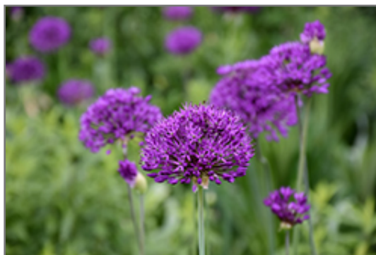
Purple Sensation Ornamental Onion flowers

Purple Sensation Ornamental Onion is an open herbaceous perennial with tall flower stalks held atop a low mound of foliage. Its relatively coarse texture can be used to stand it apart from other garden plants with finer foliage.