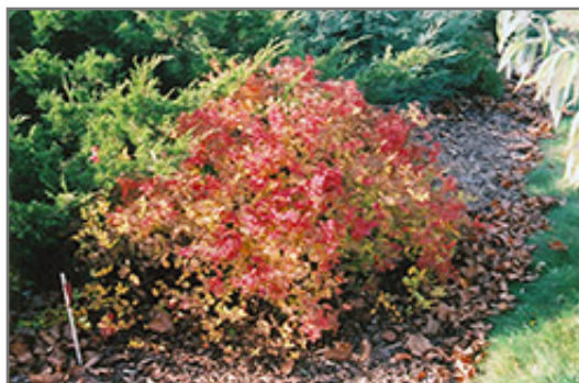
Golden Princess Spirea in fall