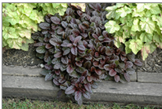
Mahogany Bugleweed