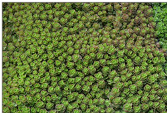
Dragon's Blood Stonecrop foliage