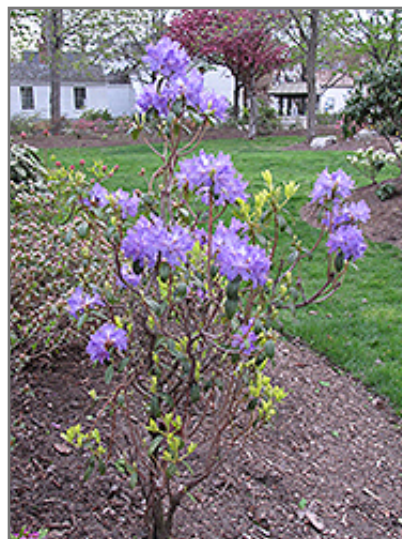
Blue Baron Rhododendron in bloom

This shrub does best in full sun to partial shade. You may want to keep it away from hot, dry locations that receive direct afternoon sun or which get reflected sunlight, such as against the south side of a white wall. It requires an evenly moist well-drained soil for optimal growth, but will die in standing water. It is very fussy about its soil conditions and must have rich, acidic soils to ensure success, and is subject to chlorosis (yellowing) of the foliage in alkaline soils. It is somewhat tolerant of urban pollution, and will benefit from being planted in a relatively sheltered location. Consider applying a thick mulch around the root zone in winter to protect it in exposed locations or colder microclimates. This particular variety is an interspecific hybrid.