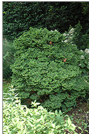
Koster's Falsecypress