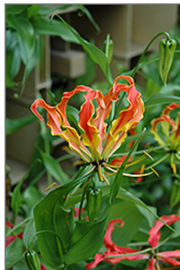
Gloriosa Lily flowers

Gloriosa Lily is recommended for the following landscape applications;