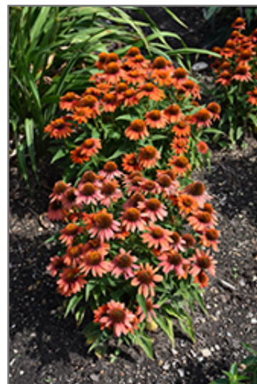
Sombrero Adobe Orange Coneflower in bloom