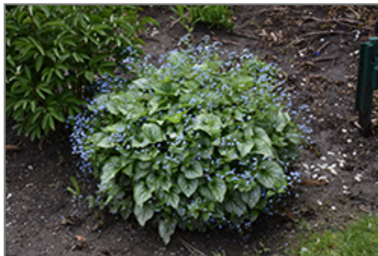
Sea Heart Bugloss in bloom

Sea Heart Bugloss will grow to be about 12 inches tall at maturity extending to 16 inches tall with the flowers, with a spread of 18 inches. When grown in masses or used as a bedding plant, individual plants should be spaced approximately 14 inches apart. It grows at a medium rate, and under ideal conditions can be expected to live for approximately 10 years. As an herbaceous perennial, this plant will usually die back to the crown each winter, and will regrow from the base each spring. Be careful not to disturb the crown in late winter when it may not be readily seen!