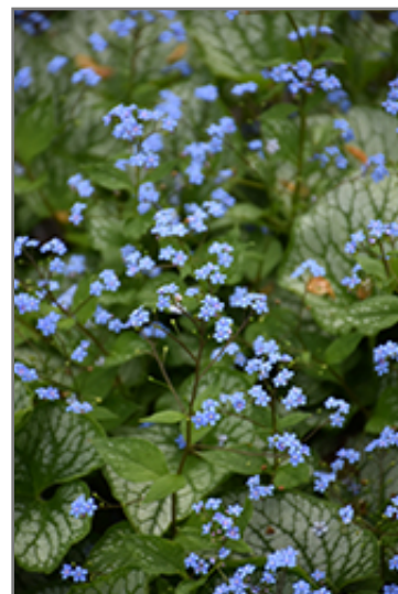
Sea Heart Bugloss flowers

Sea Heart Bugloss is recommended for the following landscape applications;