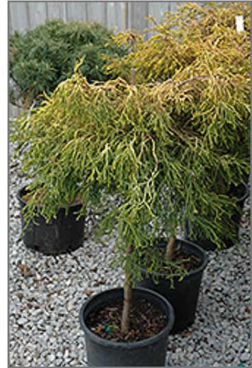
Lemon Twist Hinoki Falsecypress (tree form)

Lemon Twist Hinoki Falsecypress (tree form) will grow to be about 4 feet tall at maturity, with a spread of 3 feet. It has a low canopy with a typical clearance of 3 feet from the ground. It grows at a slow rate, and under ideal conditions can be expected to live for 70 years or more.