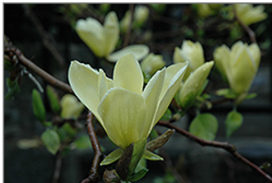
Golden Gift Magnolia flowers