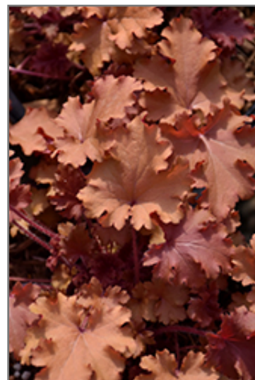
Peach Crisp Coral Bells foliage

Peach Crisp Coral Bells is a fine choice for the garden, but it is also a good selection for planting in outdoor pots and containers. With its upright habit of growth, it is best suited for use as a 'thriller' in the 'spiller-thriller-filler' container combination; plant it near the center of the pot, surrounded by smaller plants and those that spill over the edges. Note that when growing plants in outdoor containers and baskets, they may require more frequent waterings than they would in the yard or garden.