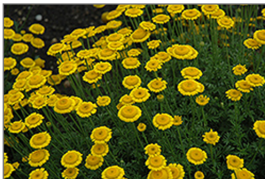
Charme Marguerite Daisy flowers

Charme Marguerite Daisy is recommended for the following landscape applications;