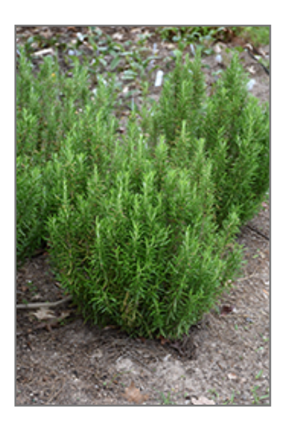
Barbeque Rosemary

Barbeque Rosemary features dainty spikes of lightly-scented blue flowers at the ends of the branches in early summer. It has attractive green evergreen foliage. The fragrant needles are highly ornamental and remain green throughout the winter.