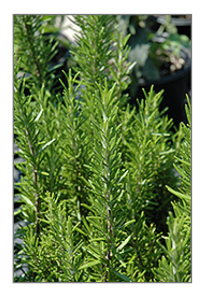
Barbeque Rosemary foliage