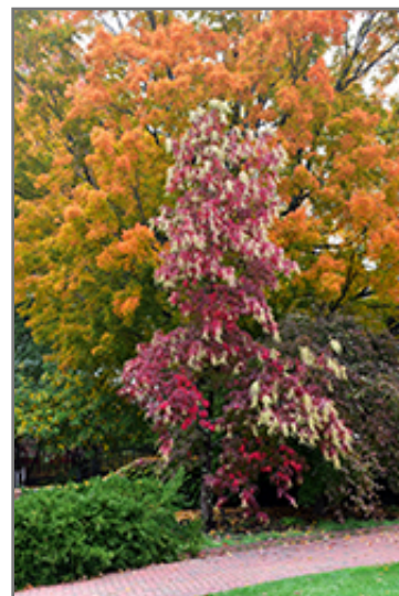
Sourwood in fall

This tree does best in full sun to partial shade. It does best in average to evenly moist conditions, but will not tolerate standing water. It is very fussy about its soil conditions and must have rich, acidic soils to ensure success, and is subject to chlorosis (yellowing) of the foliage in alkaline soils. It is quite intolerant of urban pollution, therefore inner city or urban streetside plantings are best avoided, and will benefit from being planted in a relatively sheltered location. Consider applying a thick mulch around the root zone in winter to protect it in exposed locations or colder microclimates. This species is native to parts of North America, and parts of it are known to be toxic to humans and animals, so care should be exercised in planting it around children and pets.