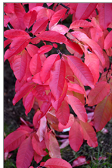
Sourwood in fall