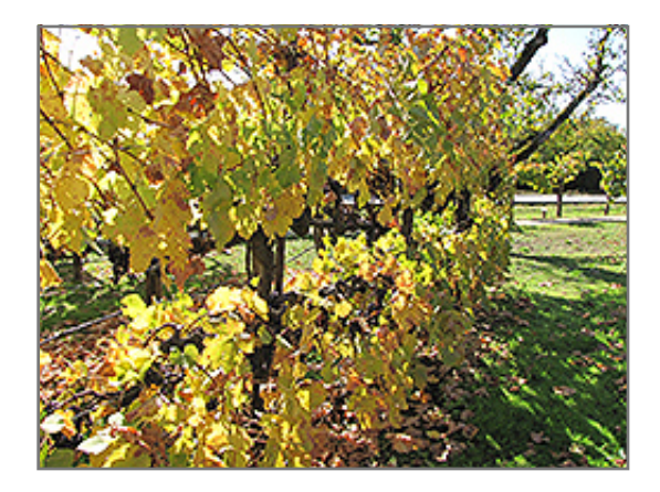
Merlot Grape in fall