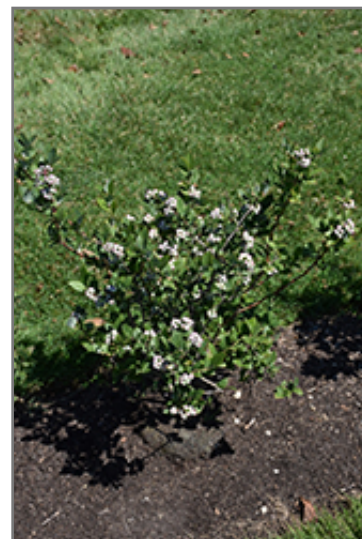
Elliott Blueberry fruit