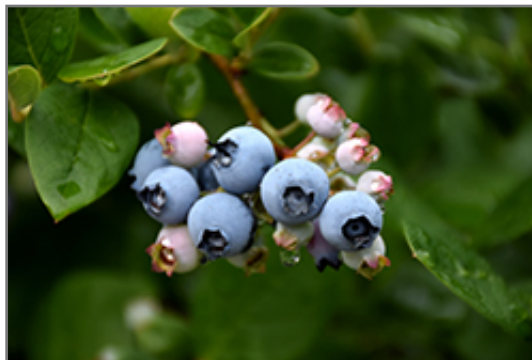
Elliott Blueberry fruit

Elliott Blueberry features dainty clusters of white bell-shaped flowers with shell pink overtones hanging below the branches in mid spring. It has green deciduous foliage. The glossy oval leaves turn yellow in fall. It features an abundance of magnificent blue berries from late summer to early fall. The smooth brick red bark adds an interesting dimension to the landscape.