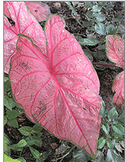
Fannie Munson Caladium foliage

Fannie Munson Caladium is recommended for the following landscape applications;