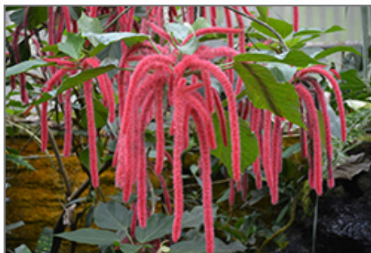
Firetail Chenille Plant flowers