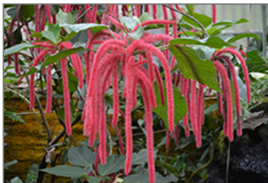
Firetail Chenille Plant flowers