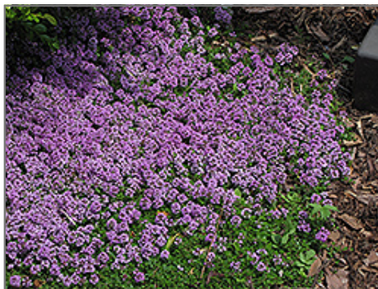
Purple Carpet Creeping Thyme in bloom