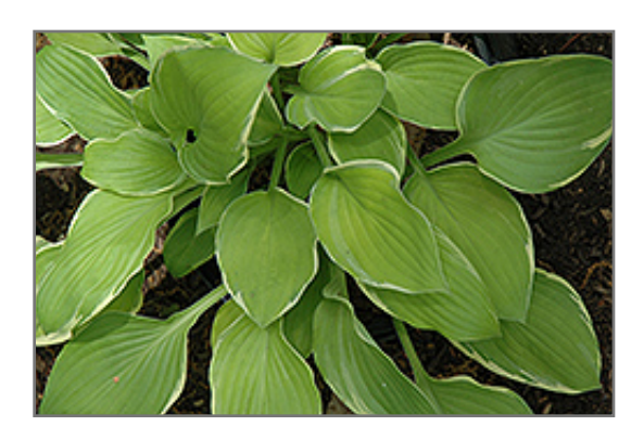
Moonlight Hosta foliage

Moonlight Hosta is recommended for the following landscape applications;