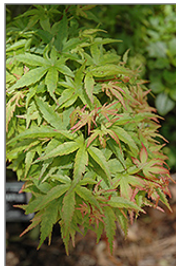
Sharp's Pygmy Japanese Maple foliage

Sharp's Pygmy Japanese Maple is recommended for the following landscape applications;