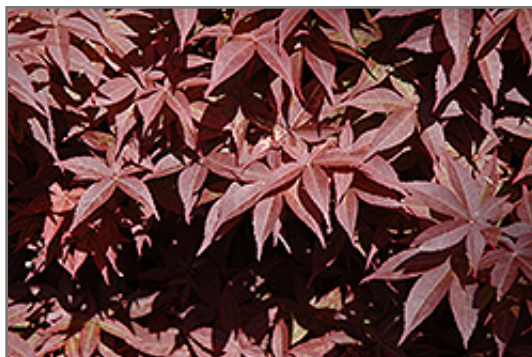
Rhode Island Red Japanese Maple foliage