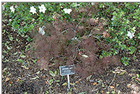
Red Feathers Japanese Maple