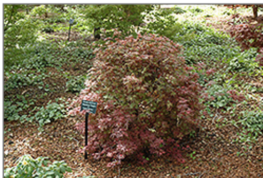
Kandy Kitchen Japanese Maple