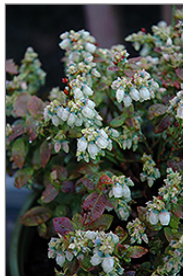
Jelly Bean Blueberry flowers

Jelly Bean Blueberry is a good choice for the edible garden, but it is also well-suited for use in outdoor pots and containers. It can be used either as 'filler' or as a 'thriller' in the 'spiller-thriller-filler' container combination, depending on the height and form of the other plants used in the container planting. It is even sizeable enough that it can be grown alone in a suitable container. Note that when grown in a container, it may not perform exactly as indicated on the tag - this is to be expected. Also note that when growing plants in outdoor containers and baskets, they may require more frequent waterings than they would in the yard or garden.