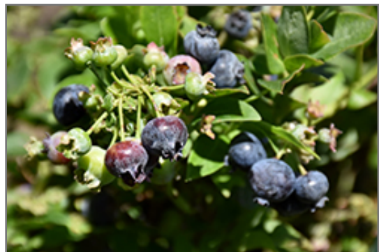
Jelly Bean Blueberry fruit