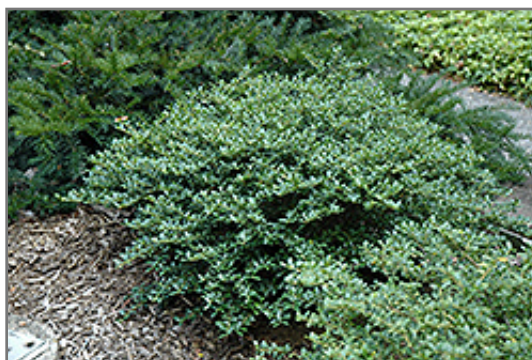
Helleri Japanese Holly