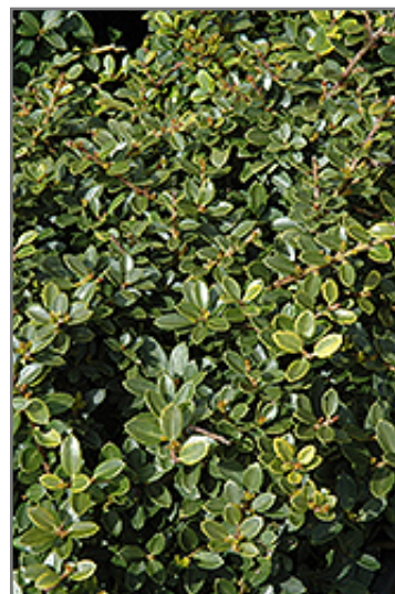
Helleri Japanese Holly foliage