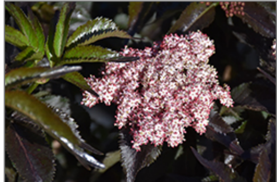
Black Tower Elder flowers

This shrub does best in full sun to partial shade. It is quite adaptable, preferring to grow in average to wet conditions, and will even tolerate some standing water. It is not particular as to soil type or pH. It is highly tolerant of urban pollution and will even thrive in inner city environments. This is a selected variety of a species not originally from North America.