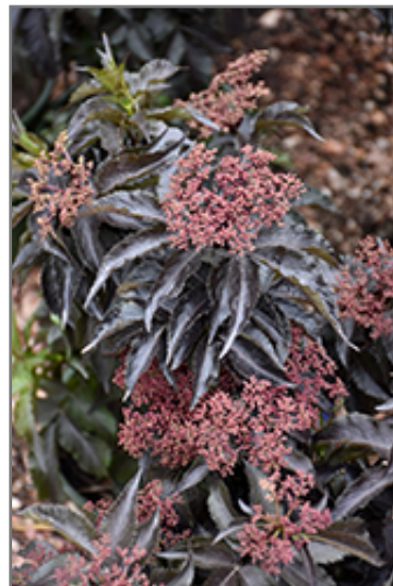
Black Tower Elder flower buds