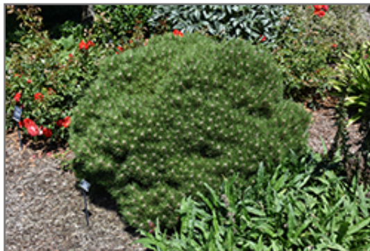
Bambino Dwarf Austrian Pine