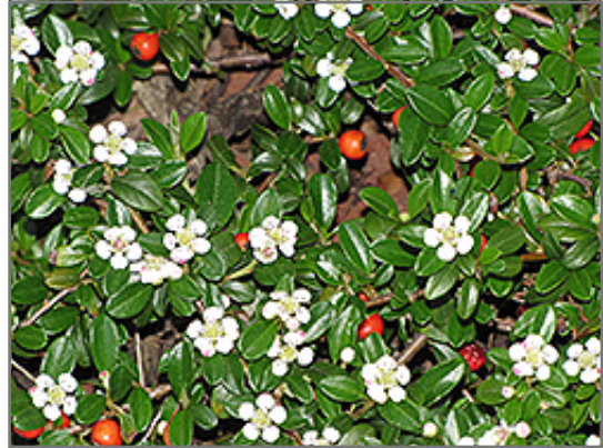
Coral Beauty Cotoneaster fruit