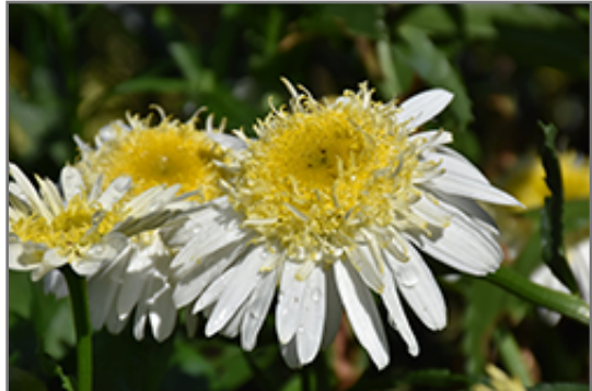
Realflor Real Glory Shasta Daisy flowers

Realflor Real Glory Shasta Daisy is recommended for the following landscape applications;