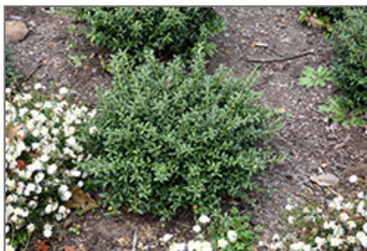
Soft Touch Japanese Holly