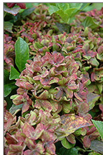
Pistachio Hydrangea flowers