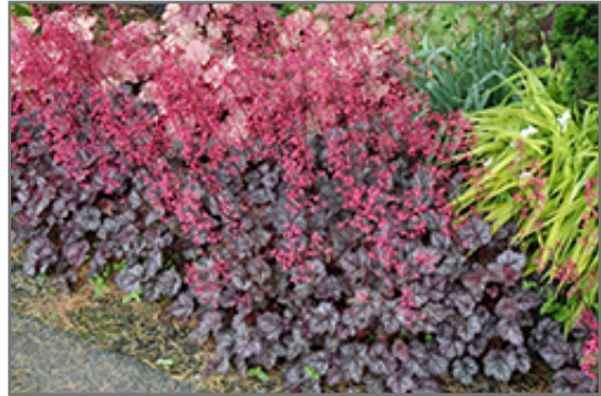
Glitter Coral Bells in bloom

This is a relatively low maintenance plant, and should be cut back in late fall in preparation for winter. It is a good choice for attracting hummingbirds to your yard. It has no significant negative characteristics.