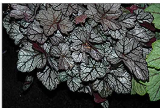
Glitter Coral Bells foliage