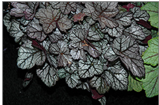
Glitter Coral Bells foliage