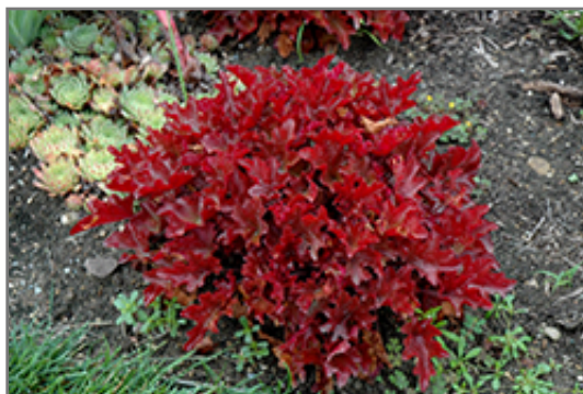
Dolce Cinnamon Curls Coral Bells