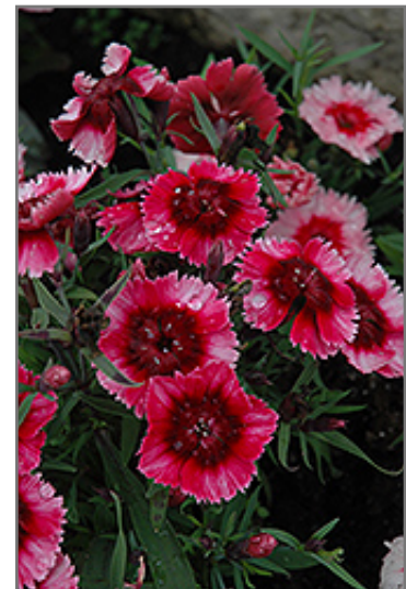
Super Parfait Raspberry Pinks flowers