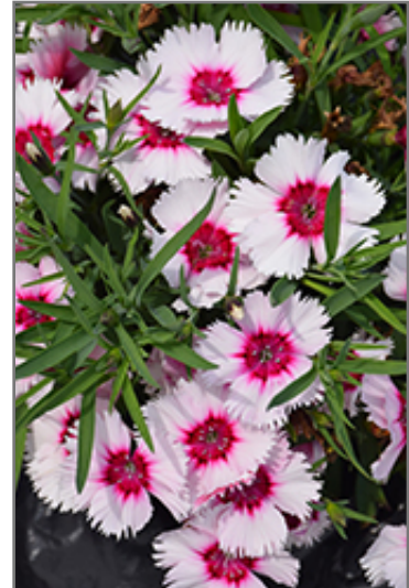
Super Parfait Raspberry Pinks flowers

Super Parfait Raspberry Pinks is a fine choice for the garden, but it is also a good selection for planting in outdoor pots and containers. It is often used as a 'filler' in the 'spiller-thriller-filler' container combination, providing a mass of flowers and foliage against which the thriller plants stand out. Note that when growing plants in outdoor containers and baskets, they may require more frequent waterings than they would in the yard or garden.