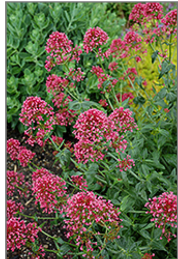
Red Valerian flowers

Red Valerian is recommended for the following landscape applications;