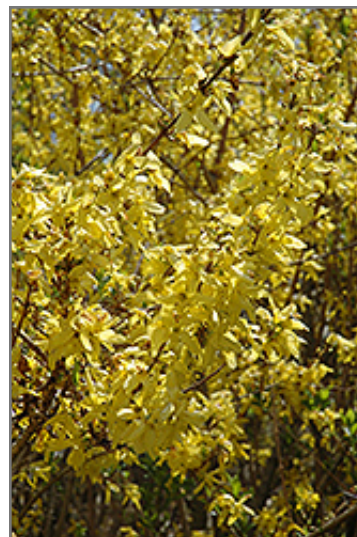
Spring Glory Forsythia flowers