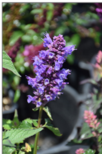
Blue Boa Hyssop flowers