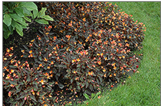
Sparks Will Fly Begonia in bloom