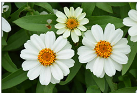
Profusion White Zinnia flowers