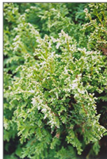
Sherwood Frost Arborvitae foliage