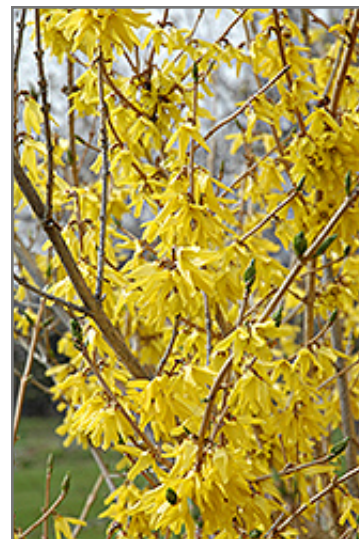
Northern Gold Forsythia flowers