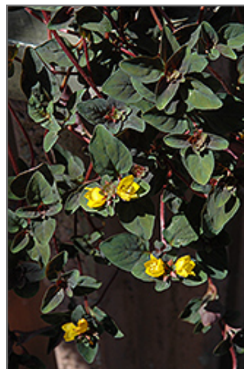
Persian Chocolate Loosestrife flowers

Persian Chocolate Loosestrife is recommended for the following landscape applications;