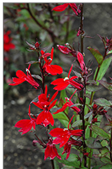
Fan Scarlet Cardinal Flower flowers