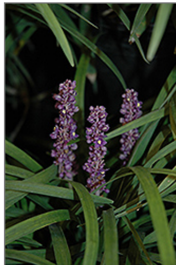
Majestic Lily Turf flowers