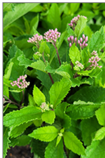
Phantom Joe Pye Weed flower buds