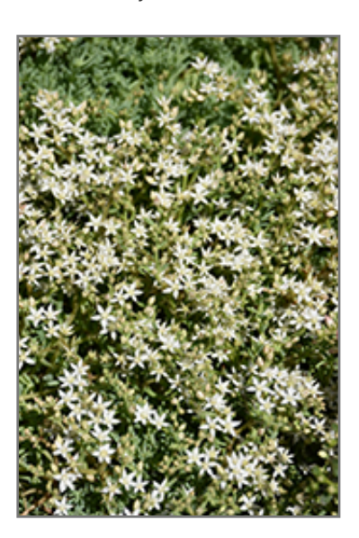
Dwarf Spanish Stonecrop flowers