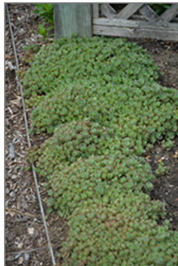
Lime Zinger Stonecrop

Lime Zinger Stonecrop is a fine choice for the garden, but it is also a good selection for planting in outdoor pots and containers. Because of its spreading habit of growth, it is ideally suited for use as a 'spiller' in the 'spiller-thriller-filler' container combination; plant it near the edges where it can spill gracefully over the pot. Note that when growing plants in outdoor containers and baskets, they may require more frequent waterings than they would in the yard or garden.