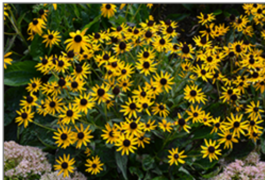
Little Goldstar Coneflower in bloom

This is a relatively low maintenance plant, and should be cut back in late fall in preparation for winter. It is a good choice for attracting butterflies to your yard, but is not particularly attractive to deer who tend to leave it alone in favor of tastier treats. It has no significant negative characteristics.