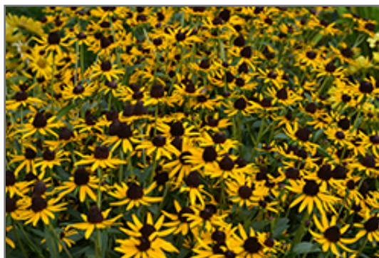
Little Goldstar Coneflower flowers